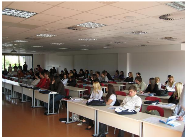
In the picture: Students of the programme Business in Modern Society